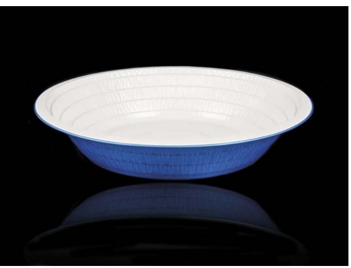
Contital: Aluminium Plates

Contital won this prize for the introduction of a range of recyclable 'aluminium plates' as a credible and economic alternative to disposable dining plates which are non-recyclable. The patented product range has been developed with specific technical characteristics to ensure strength despite the low thickness and to withstand the stress of transportation, sealing and storage, as well as heating and freezing. ///