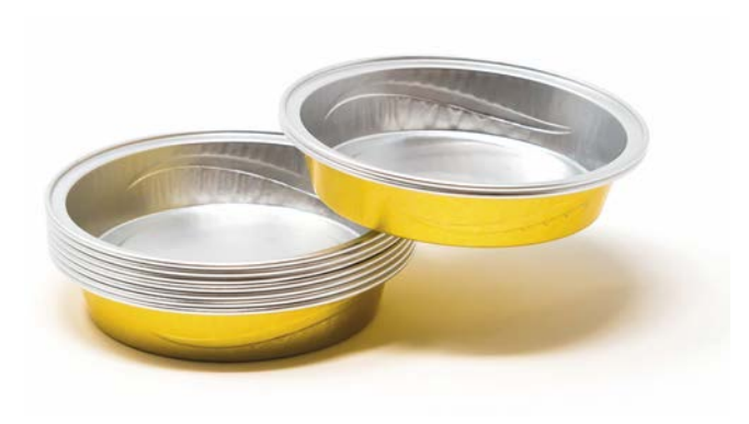
Constantia Flexibles: 3D sidewall-embossing for Alufoilcontainer

Constantia Flexibles won for its novel 3D sidewall embossing technology. This enables the introduction of branding or messages on smaller aluminium foil portion packs without having to print, as well as offering both optic and haptic differentiation. Forming is achieved in a single step, in-line process, during vertical deep drawing. This required the development of special tool parts as well as modifications to the sidewall angles of the containers. ///