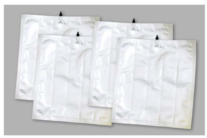
Wipf: Gasbag for E-Active Body Control

Wipf has received an Alufoil Trophy on its work to develop a totally new suspension system, with its aluminium foil Gasbag for E-Active Body Control technology, for Mercedes-Benz's latest GLE model. The system, which incorporates the gasbag, influences the lift and yaw of the car body when cornering, accelerating and braking. The gasbag features a layer of high-density aluminium foil and several layers of various polyamide films. The aluminium assures very high impermeability to gas while preserving mechanical, thermal, and chemical stability in hydraulic fluid. ///