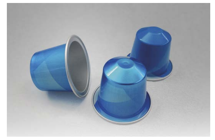
Amcor: ASI aluminium for coffee capsules

A joint development with the Aluminium Stewardship Initiative (ASI) organization, Nespresso and selected mining corporations has won Amcor an award for an ASI aluminium coffee capsule, which will be marketed by Nespresso. The capsule uses ASI certified aluminium to improve the sustainability position of both product and brand. The initiative creates a chain of custody as the whole process needs to be certified and can set a standard for the whole industry. ///