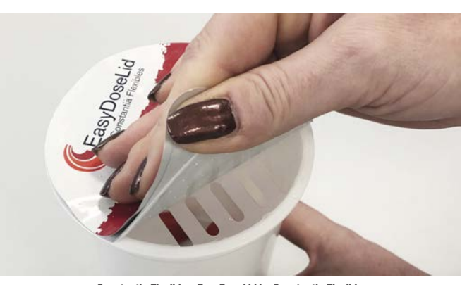
Constantia Flexibles: EasyDoseLid by Constantia Flexibles

The EasyDoseLid from Constantia Flexibles received an award for its lidding system, designed for solid consumer food products stored in liquids, such as mozzarella cheese, pickled cheese, pickles and olives, which become easily separable from the liquid thanks to this novel pouring system. A double layer of aluminium and a coextruded plastic, with special laser cutting, enables the liquid to be poured out before the solid content is dispensed. ///