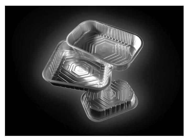
i2r Packaging Solutions: 12r Ultra

i2r Packaging Solutions gained an award for its Ultra™, an innovative, smoothwall aluminium foil container, intended for packaging high quality 'ready to cook' convenience products including red meat, poultry, fish, vegetables, BBQ food and desserts. Three key design features were applied to add a significant amount of additional structural strength and an overall reduction in pack weight. ///