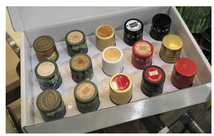
Guala Closures Group: Savin Prestige

Guala Closures Group received the award for its Savin Prestige range of aluminium screwcap closures. The concept consists of combining a closure made with an aluminium shell together with a top insert made of a different material, such as wood or fabric, to enhance its aesthetics and create original and eclectic combinations. The concept can be applied to standard aluminium closures for wine and spirits and allows the creation of a personal style or customization of the closure. ///