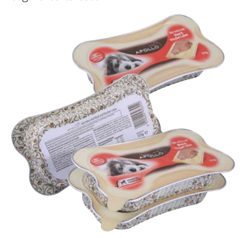
Constantia Flexibles – Bone-Shape Container with high-end printing

A Bone-Shaped Container pack, designed for wet dog food, has a powerful shelf appearance and message, agreed the Trophy judges. The entire aluminium foil pack, created by Constantia Flexibles for German pet food manufacturer saturn petcare, is also printed to underline bones as one of any dogs' favourite foods.