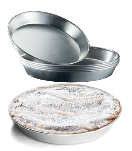
Contital - Happy Day

A semi–smoothwall container range, branded as "Happy Day" by makers Contital , is round, rigid, reusable and recyclable; and is made using a cold moulding process instead of the traditional turning technique. This offers resource savings on several fronts, the judges decided.