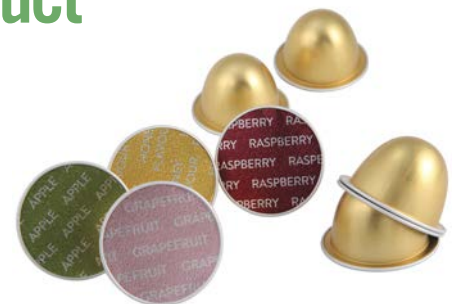
ABInBev and Constantia Flexibles – Capsule for beer flavour dispenser

concentrated flavours in individual syrups over the whole shelf-life. A major consideration was the piercing performance of the aluminium foil lids in the new dispensing system. ///