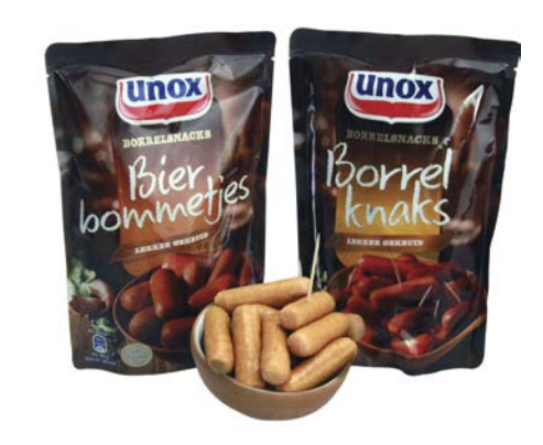
Huhtamaki - Straight'n'Easy

The film used has a multilayer design with an aluminium barrier and patented Huhtamaki Terolen® film. It is characterised by excellent processing