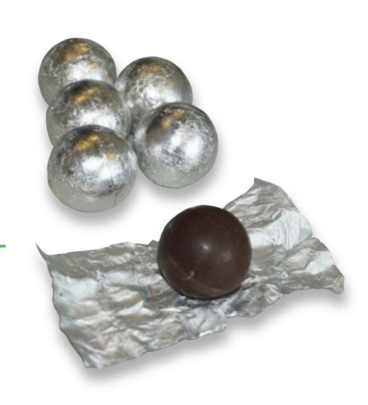
{\bf Constantia\ Flexibles-CONSTANTIA\ Unshredded\ Wrap}

"Simple solutions are the best and this scored the highest marks for its sheer simplicity. But one should not underestimate the elegance of it either." Guido Schmitz