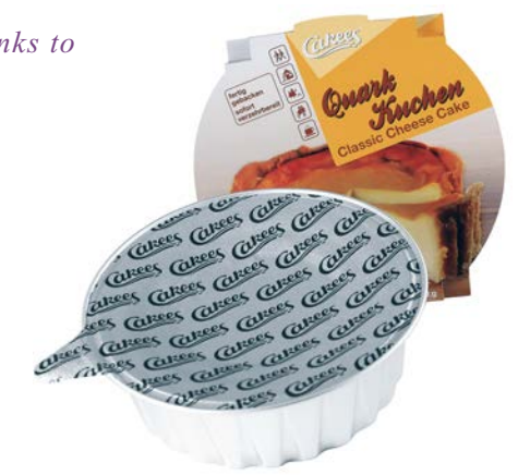
Constantia Flexibles - Cakees - Ready-to-eat cakes