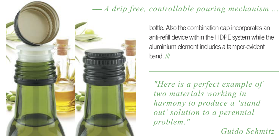
closurelogic - OLIO Premium

bottle. Also the combination cap incorporates an anti-refill device within the HDPE system while the aluminium element includes a tamper-evident band. ///