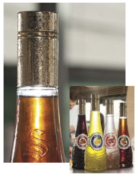
Guala Closures - 3D Embossing for Salute

This is a standard aluminium closure which, for the first time, can be decorated with digital printing and then metallized with 'sputtering' technology. This technique allows closures to be decorated by a thin pure metal coating in a specific colour. Different technologies have been merged in one production line to achieve a completely new decoration process. ///