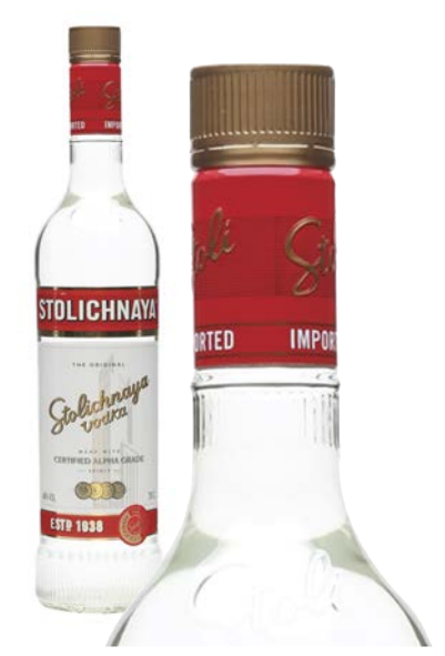
Guala Closures - Siena for Stolichnaya

The main features characterizing the closure are the side embossed logo and oriented hotfoil decoration, giving to the consumer a tactile experience. The upper part of the closure features a knurled profile to increase the grip during opening. In selected markets anti-counterfeit and anti-refill technology will be available. ///