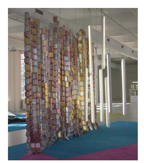
Jessica Stockholder: Bright Longing and Soggy Up The Hill, detail (2005).

More and more contemporary artists are using everyday items and industrial products to show different aspects of how art can be interpreted. Objects made from aluminium foil are proving to be an ideal medium.