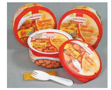
The microwaveable alu-bowl and easy peel closure from Impress Group.

A handy ready meals microwaveable aluminium bowl with easy peel closure from Impress Group is being used for Dreistern Konserven's range of Hot & Cool products. The packs come with a plastic over-closure for use during heating and a fork for convenience.