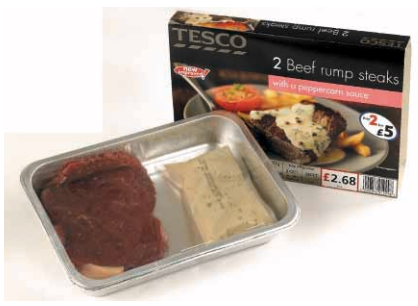
Alufoil containers like this from Nicholl Food Packaging for Tesco provide a good example of foil's convenient credentials

The independent study, which is due to be published shortly, highlights alufoil's heat conformity characteristics as a major advantage for microwave food packaging. Among its other advantages are its heat conductivity, good visual appearance and recycling credentials.