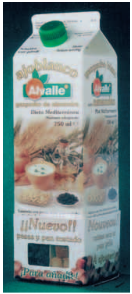
The top prize, the Global SIAL d'Or was won by Spanish company Alvalle for its 'Ajoblanco', a traditional recipe gazpacho soup packed in a foil lined carton.

Identified as 'commercial successes', the products are categorised by region and by application such as catering, fish products, meat and poultry, milk products, alcoholic drinks, fruits and vegetables. Of the 34 products chosen for an award, 18 had aluminium foil in their packaging (lids, laminated cartons, stand-up pouches) – proof of the versatility and marketing appeal of the material.